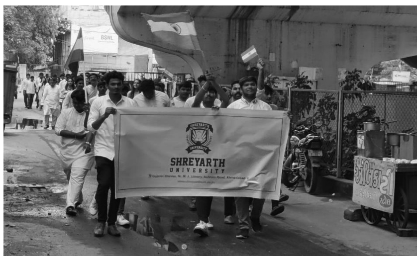
Students doing 'Tiranga Yatra' on the Independence Day