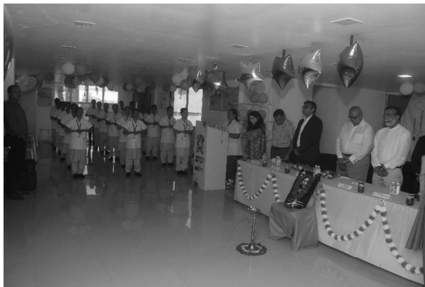
Students taking an Oath before going on posting