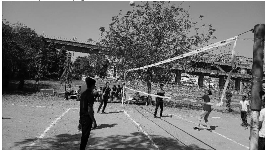
Students of the Shreyarth University playing Wally-ball

Description: University has organised two days sports events for the students of the University in the Gujarat Vidyapeeth Ground.