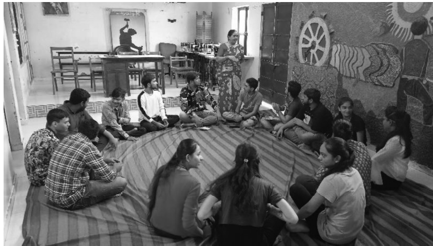
A member of NGO explaining the 'Small Saving' at the NGO

Description: Jeevan-Tirth NGO, or Non-Governmental Organization, is a not-for-profit organization that operates independently from any government and is typically focused on addressing social, environmental, humanitarian, or developmental issues. NGOs play a crucial role in advocating for social change, providing services to communities in need, and promoting sustainable development initiatives. To understand the purpose of the NGO, a visit was organised for the students and our BBA, BCA students have visited 'Jeevantirth' NGO at Vadaj as a part of the field study.