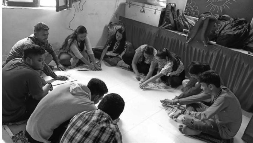
Students were given activity to perform at the NGO

12. Name of the Event: Poster Making Competition