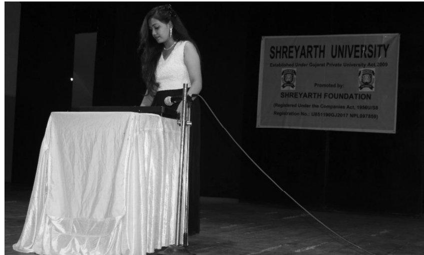
BCA Student playing Piano