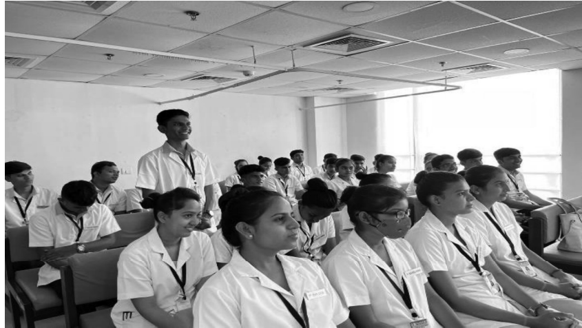
Student asking question in the Shalby Hospital