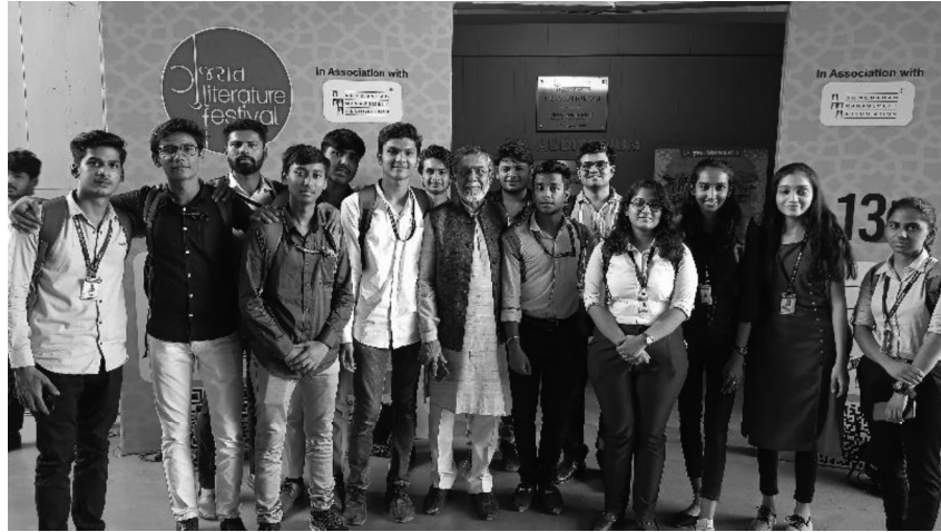
Students of BBA and Registrar of Shreyarth University at 9 th Gujarat Literature Festival