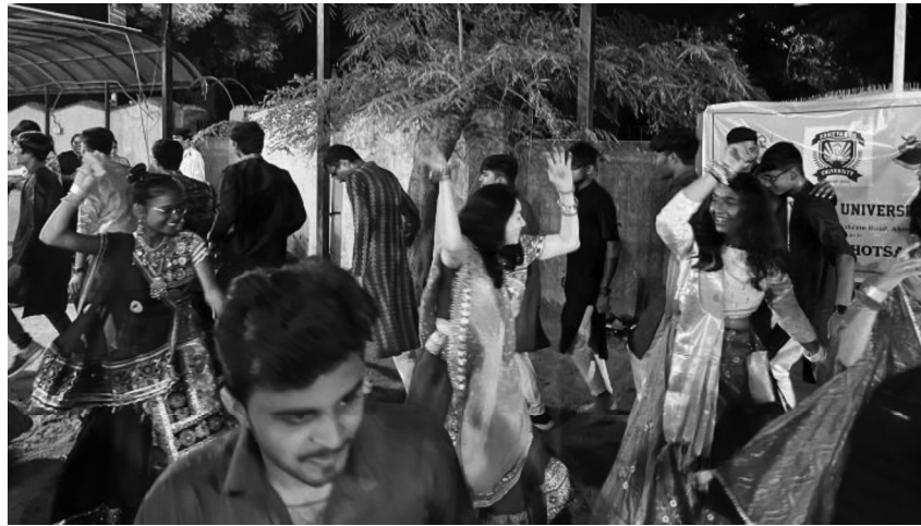
Students of the Shreyarth University playing the Garba