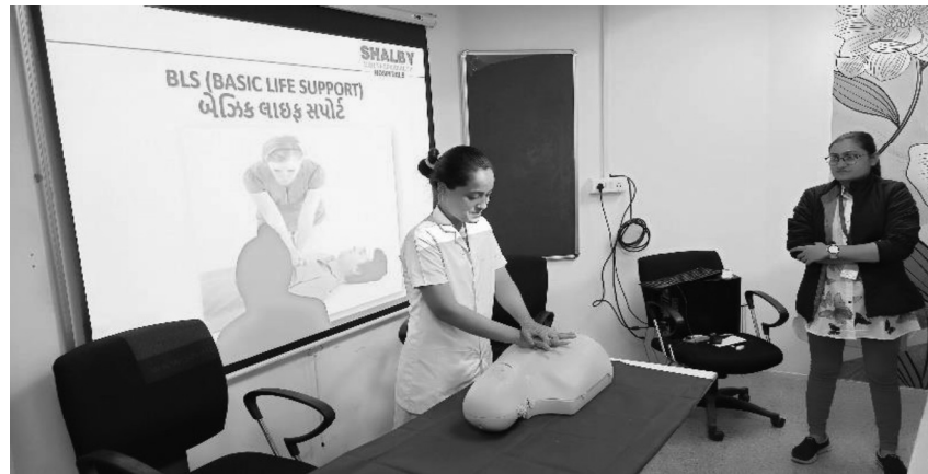
Student doing practical of BLS