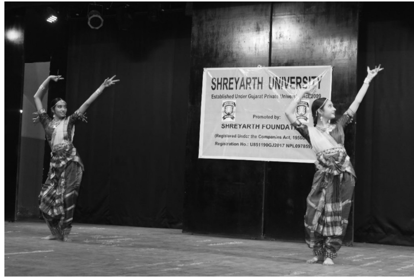
BBA students playing classical dance