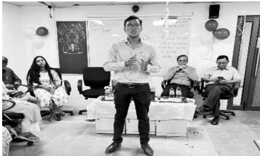
Delegate addressing the students