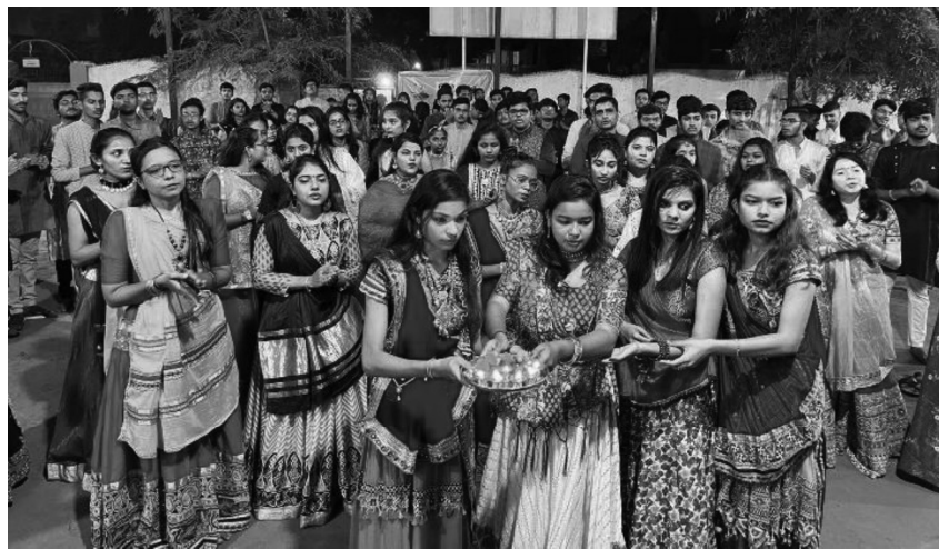
Students of the Shreyarth University doing Aarti