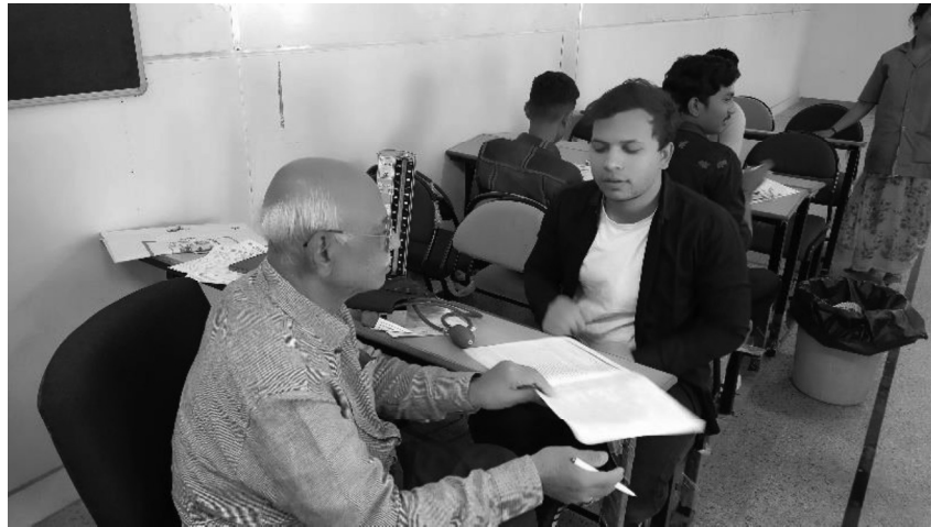
Member came for the blood donation were taking information from the student

Description: A blood donation camp was organised by the Shreyarth College of Nursing in association with HDFC bank.