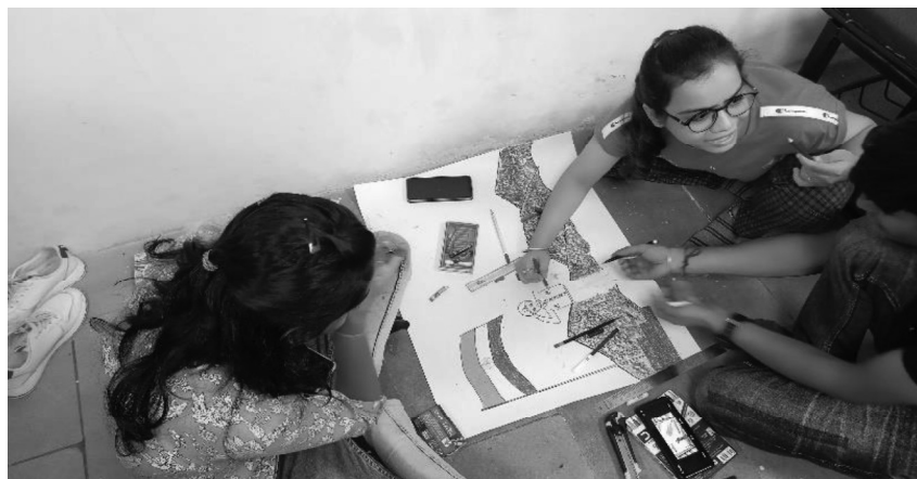
BBA Students making poster