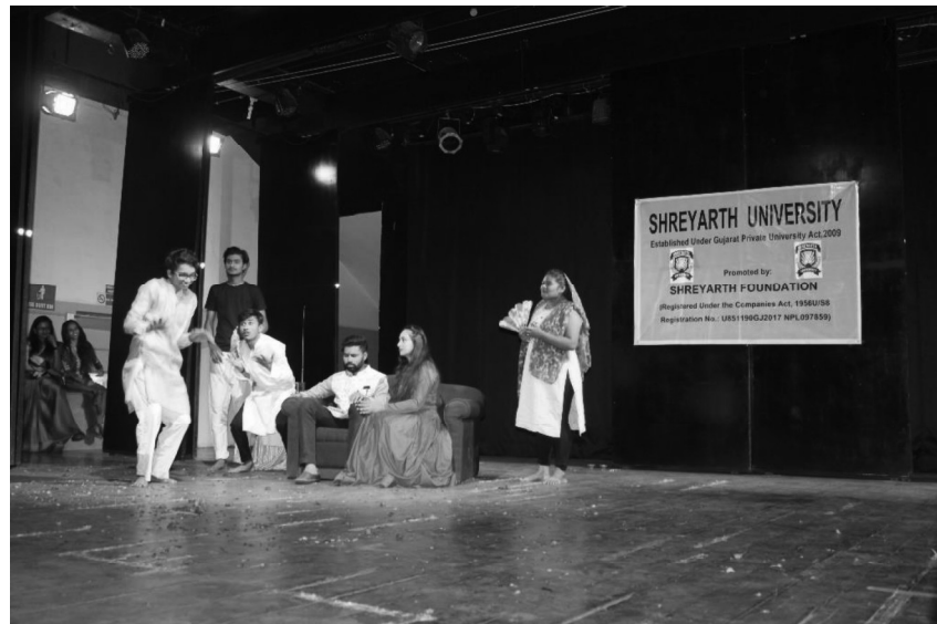
Group of BBA and BCA students performing drama