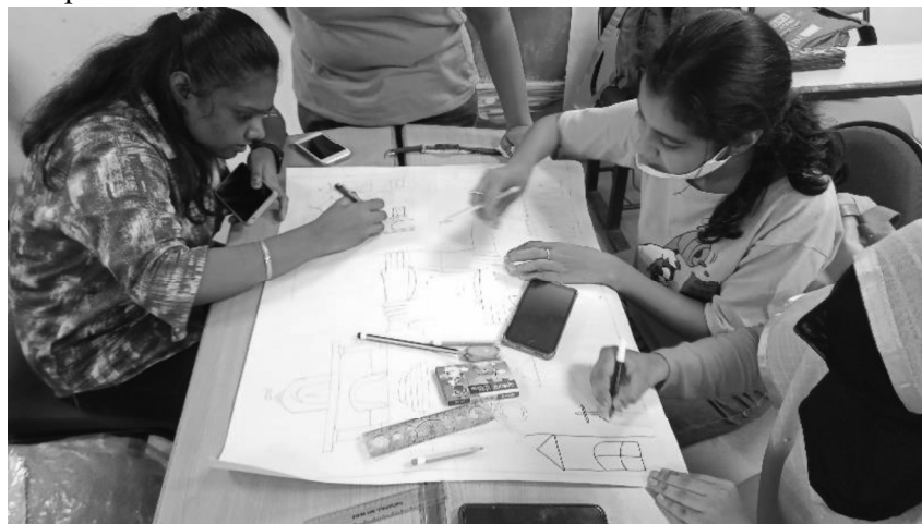
BCA Students making poster

Description: A Poster Making Competition was organised for the students of the University as a part of the 'Azadi ka Amrit Mahotsav'.