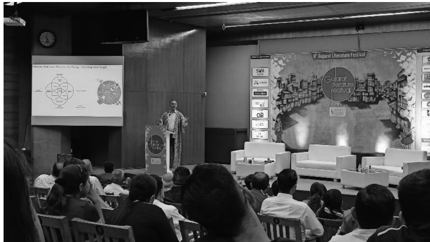
Delegate Expert was explaining the audience about the 'Ikigai'

Description: 9th Gujarat Literature Festival was held from 11 to 13th May 2022 at Ahmedabad Management Association (AMA) to provide a platform for authors, poets, scholars, artists, and cultural enthusiasts to come together to engage in discussions, presentations, performances, and workshops related to literature and various forms of creative expression. Our BBA students have visited 9th Gujarat Literature Festival at AMA, Ahmedabad, there they attended book fair, session on 'Ikigai'.