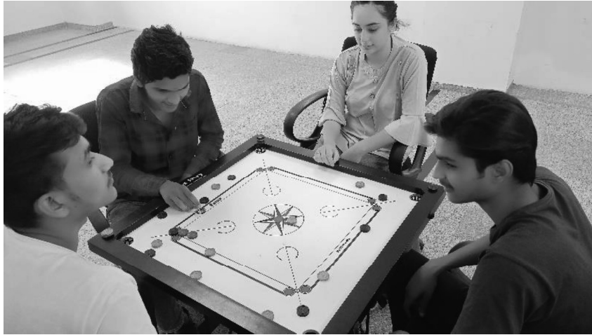
Students of the Shreyarth University playing Carrom