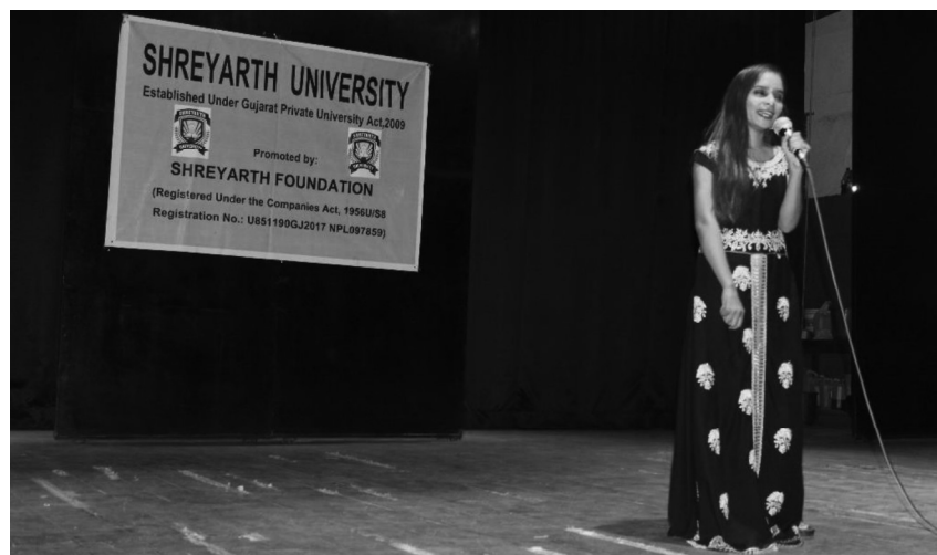
B. Sc. Nursing student playing solo singing