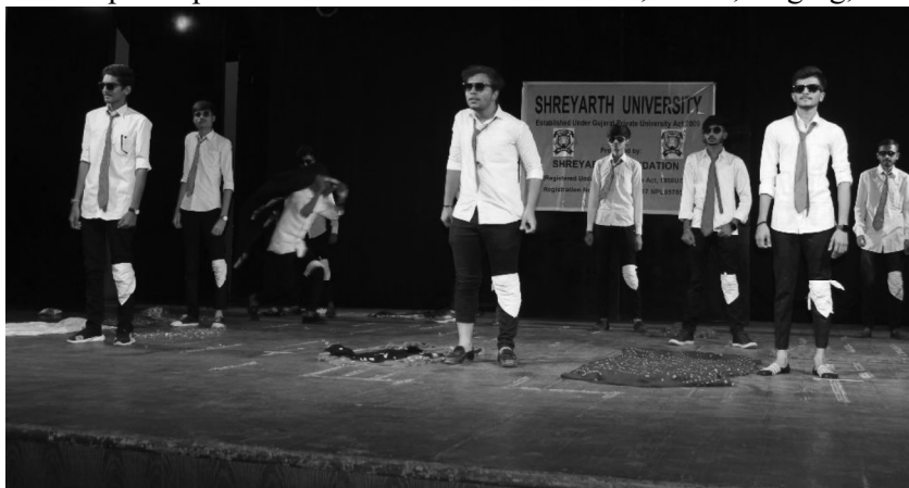
B. Sc. Nursing Students presenting Group Dance

Description: The annual function of a university, also known as the university's annual celebration, is a significant event that typically takes place once a year and serves various purposes within the academic community. Annual function includes Recognition of Activity, cultural performances, Alumni Reunion, Academic Symposium, Networking and Socialising, etc. University has organised its annual/cultural function at the H K Hall, Ahmedabad for its students. Students of all the branches have participated in various events like drama, dance, singing, etc.