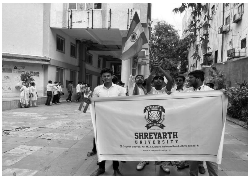
Students doing 'Tiranga Yatra' on the Independence Day