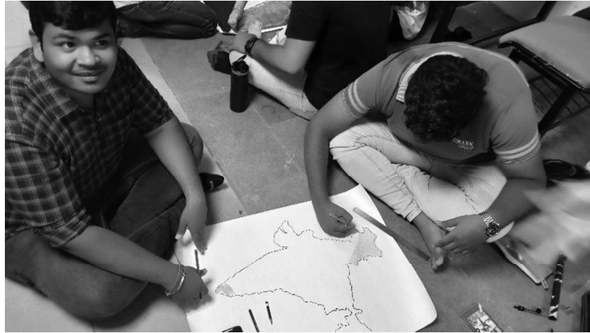
BBA Students making poster