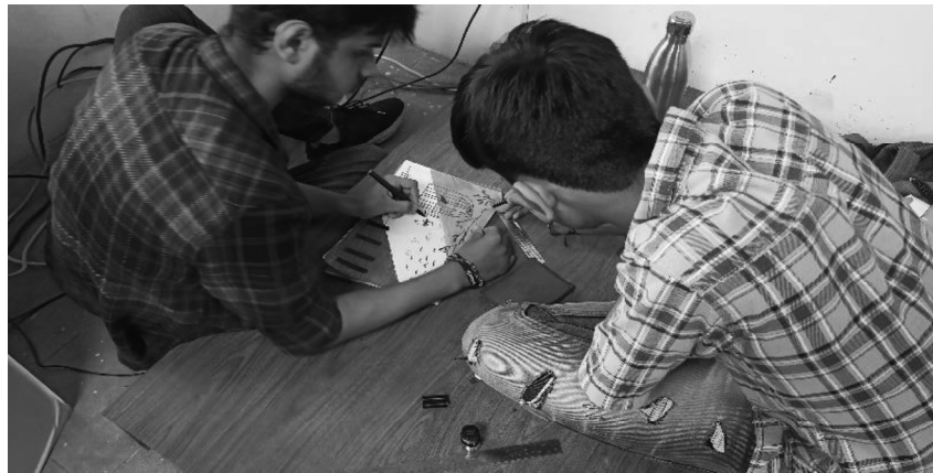
BCA Students making poster