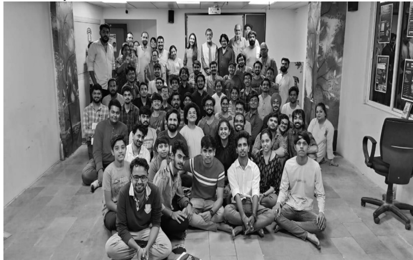
Group photo with Shri Raghuvir Yadav

Description: A workshop was organised for the promotion of Performing arts in which actor Shri Raghuvir Yadav, an Actor was invited and he has conducted workshop for two days.