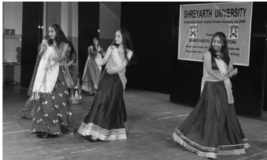
BBA students playing group dance