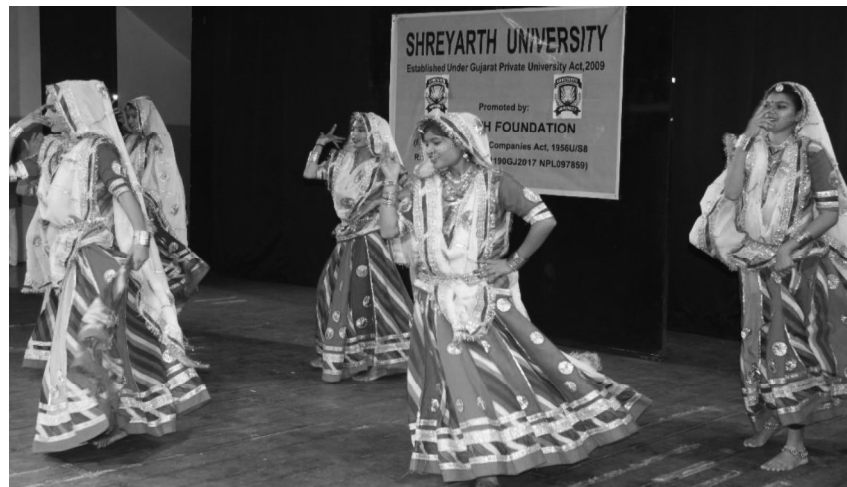
B. Sc. Nursing students playing Ghumar