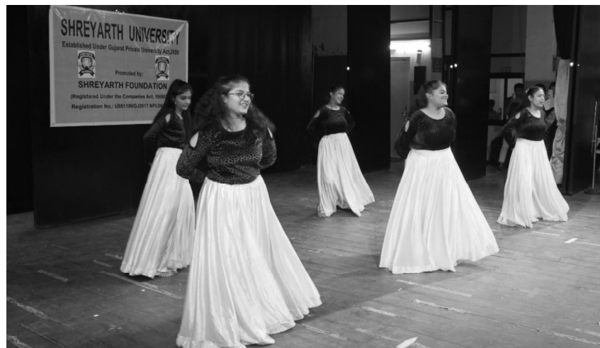
BBA Student playing group dance