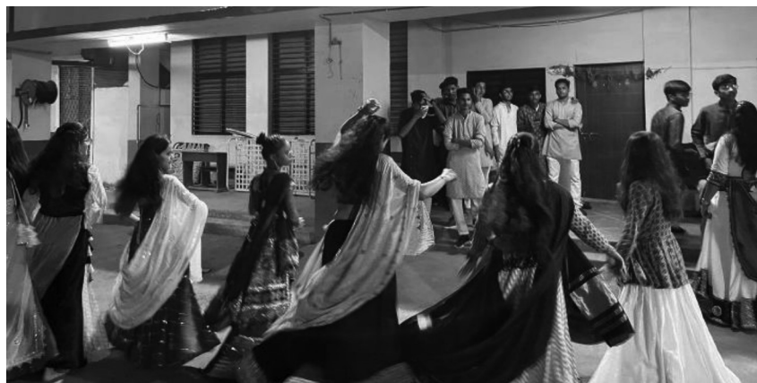
Students of the Shreyarth University playing the Garba