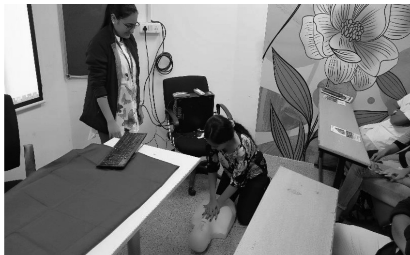
Student doing practical of BLS