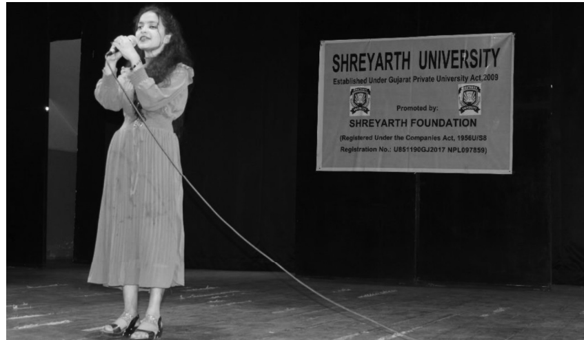
B. Sc. Nursing students playing solo singing