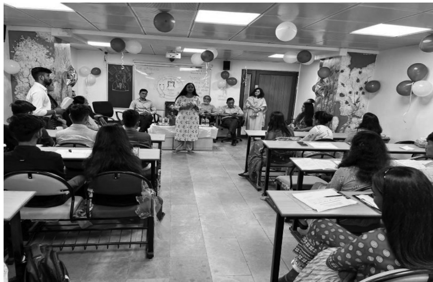
Delegate addressing the students

Description: Nurses' Day is an annual celebration dedicated to honouring and appreciating the contributions of nurses to healthcare and society. It provides an opportunity to recognize the hard work, dedication, and compassion of nurses who play a vital role in patient care, health promotion, and disease prevention. Nurses' Day celebrations can take various forms depending on the institution and community, but here are some common elements often seen in these celebrations like recognition and appreciation, health and wellness initiatives and activities under it, professional networking event, etc. Shreyarth College of Nursing has celebrated International Nurses' Day and invited delegates from Hospitals and spreaded awareness to the students.